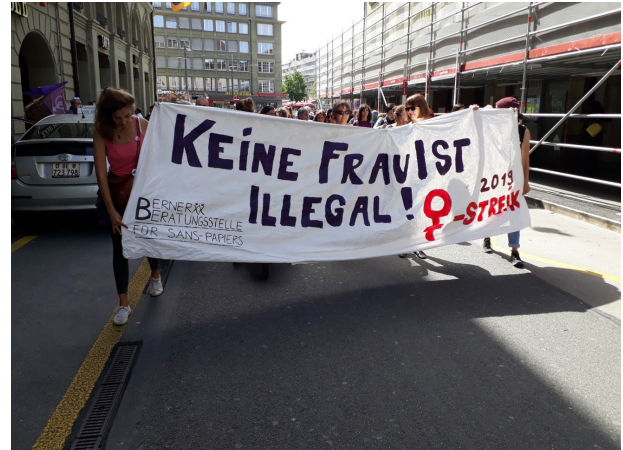
No woman is illegal - Women's strike 2019 in Bern, Bern Counselling office for undocumented Migrants

workload of our Bern Counselling Office for Undocumented Migrants will increase immensely, so will the need for our support.